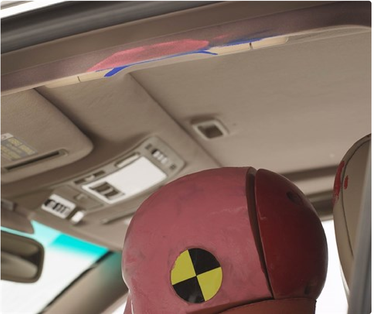
Smeared greasepaint indicates where the dummy's head hit the roof rail during rebound in the second test. Head acceleration from this hit was low.