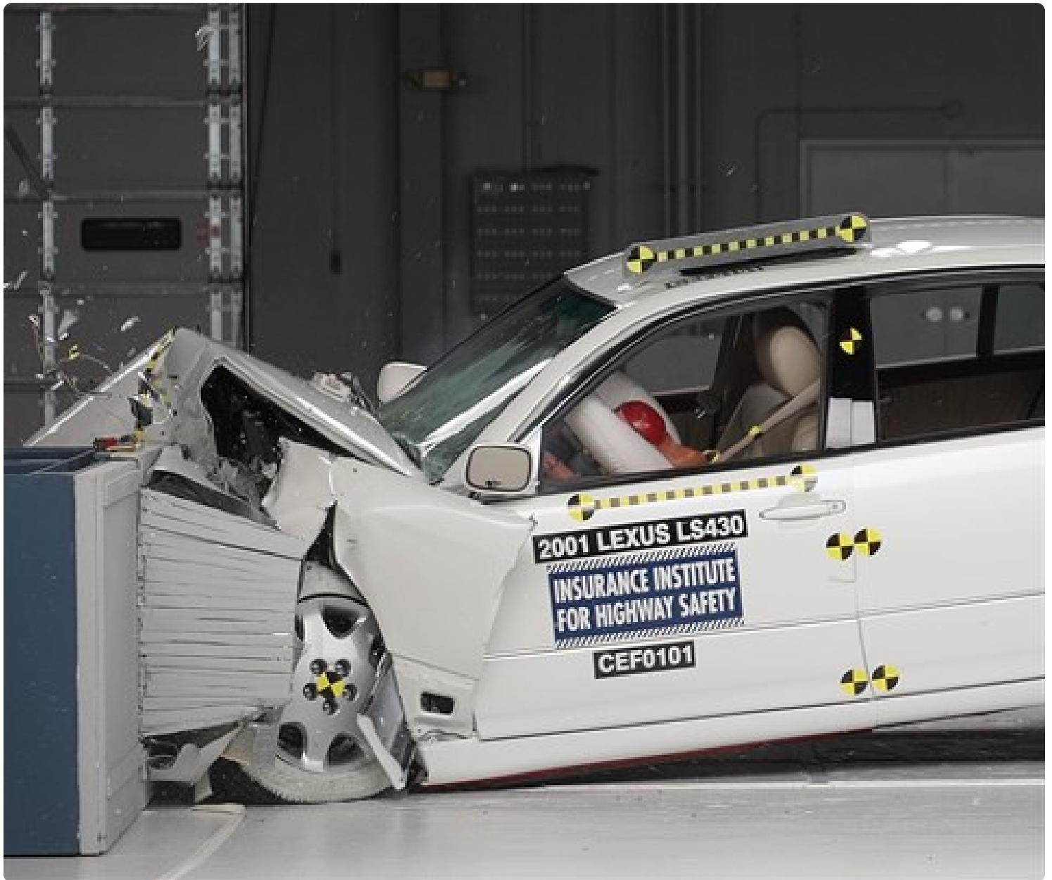
Action shot taken during the frontal offset crash test.