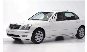
2001 Lexus LS shown